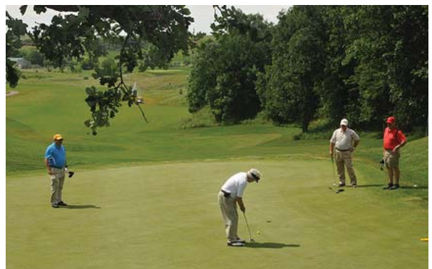
Golfers enjoy a beautiful afternoon at Hawktree Golf Club.

Winners may pick up their prizes at the registration table. Thanks to all the golfers for participating and making it a fun-filled day.