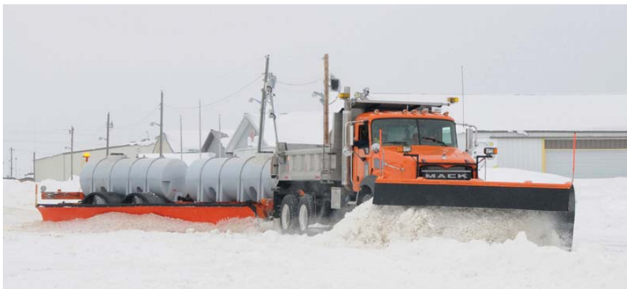
NDDOT's tow plow at work.

To get a first-hand look at the tow plow and other plowing equipment, along with our Maintenance Division Support System Program (MDSS), register for the Maintenance Tour taking place on Tuesday. You will also have the opportunity to hear about some of the major changes in our plow truck package over the past year including the benefits of the REPTO (rear mount power take off).